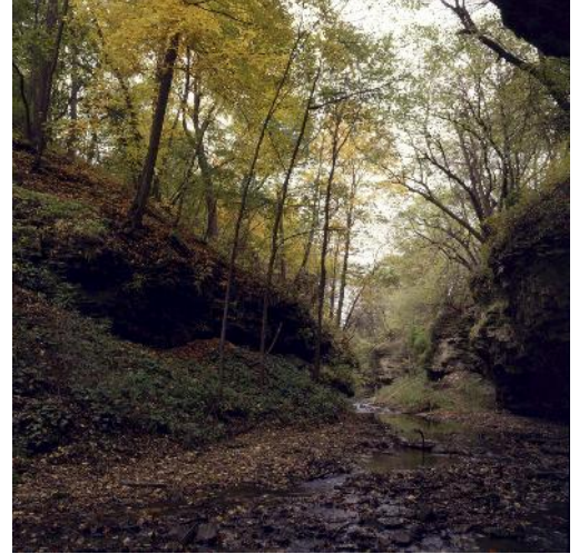
2 1/4 Slides 2nd Ed Siems