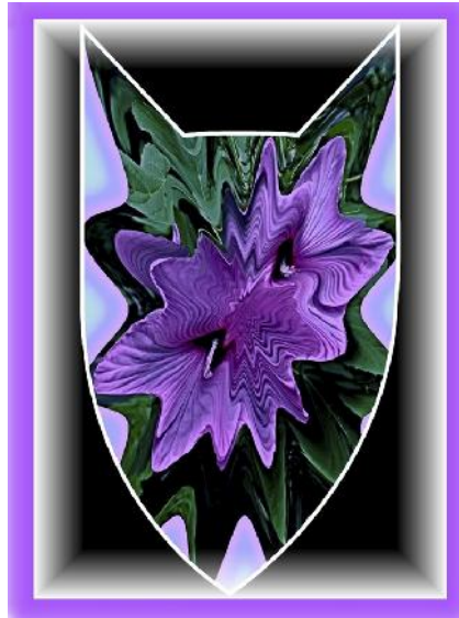
Creative Print 3rd Jim Svec